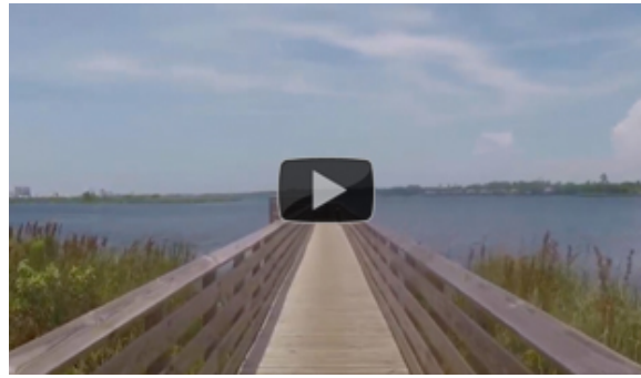
The Beach Welcomes Everyone to TRAVEL WITHOUT LIMITS