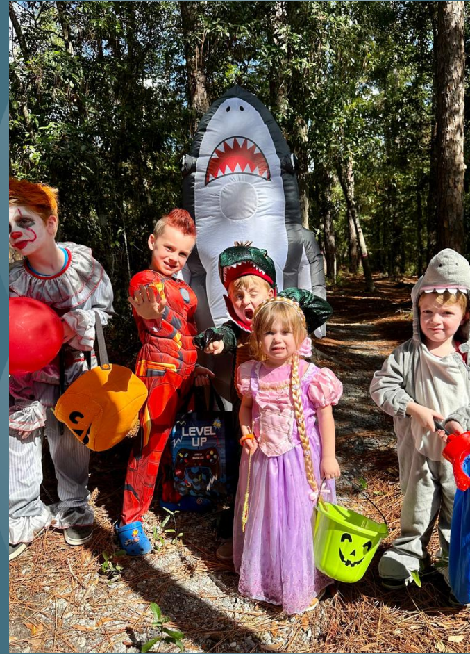
Trek or Treat