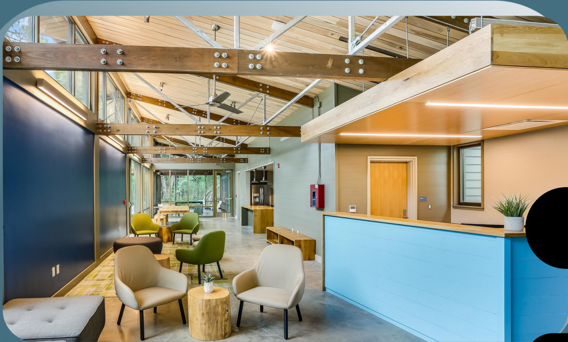
INDOOR & OUTDOOR CLASSROOMS